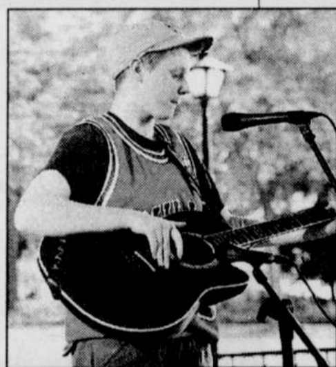
Wowing the crowd at Eugene Pride