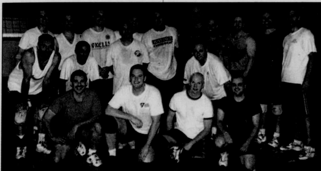
Members of Portland Team Volleyball get hot and sweaty every Sunday