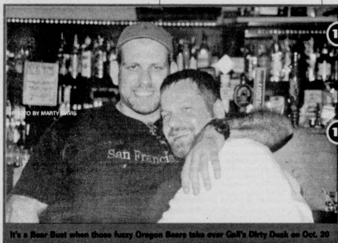
It's a Bear Bust when those fuzzy Oregon Bears take over Gail's Dirty Duck on Oct. 20

See On View and Onstage listings on Page 30.