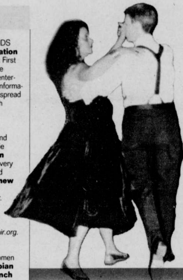
Out Dancing invites you to fox-trot over to the Harvest Ball for a fun evening of ballroom dancing Oct. 13

Get connected. Women gather for the Lesbian Connection Brunch every Sunday at L & L Bakery in Eugene. (11 am. 1591 Willamette St.