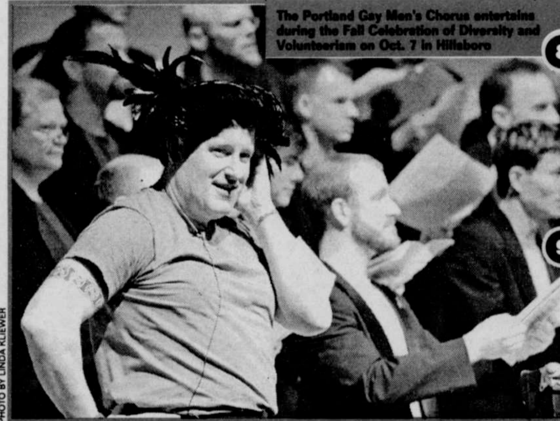
The Portland Gay Men's Chorus entertains during the Fall Celebration of Diversity and Volunteerism on Oct. 7 in Hillsboro

The Lesbian, Gay, Bisexual, Transgender Educational and Support Services Program at University of Oregon holds a speakers panel on "Intergenerational Perspectives on Coming Out Transgendered" in the Ben