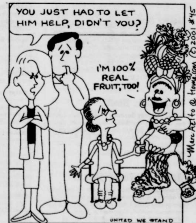
Marc Acito © Home.com 2001 #45