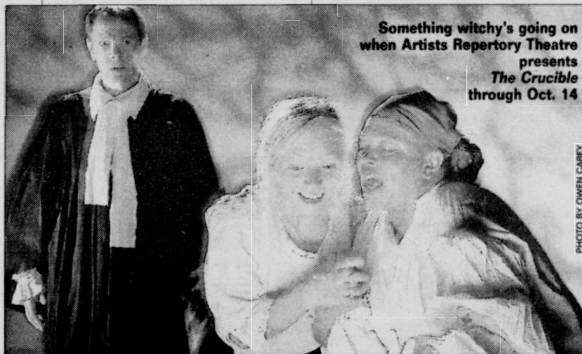
Something witchy's going on when Artists Repertory Theatre presents The Crucible through Oct. 14

The West Hills will be alive with the sounds of "crisp apple strudel and warm woolen mittens" when 500 avid Julie