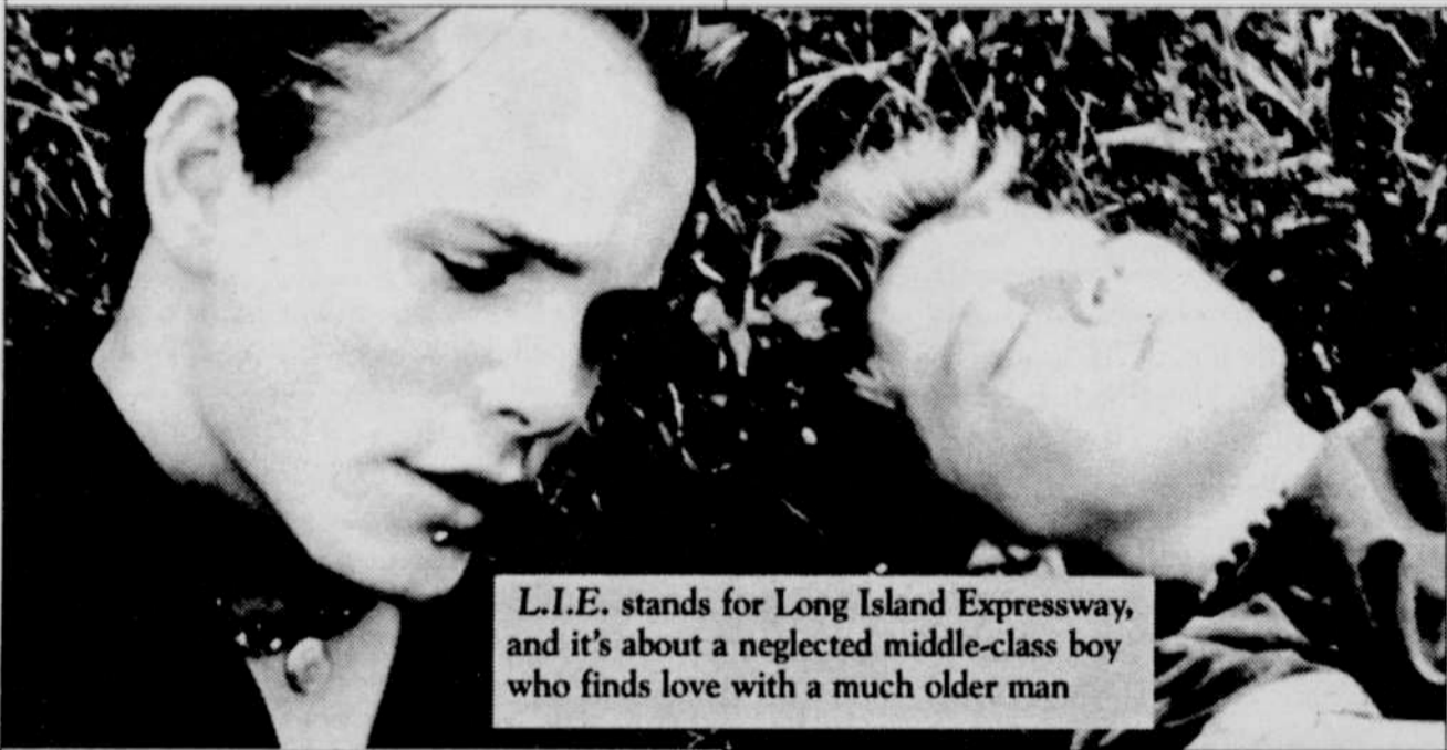
L.I.E. stands for Long Island Expressway, and it's about a neglected middle-class boy who finds love with a much older man

O FANTASMA: A Brazilian offering about a