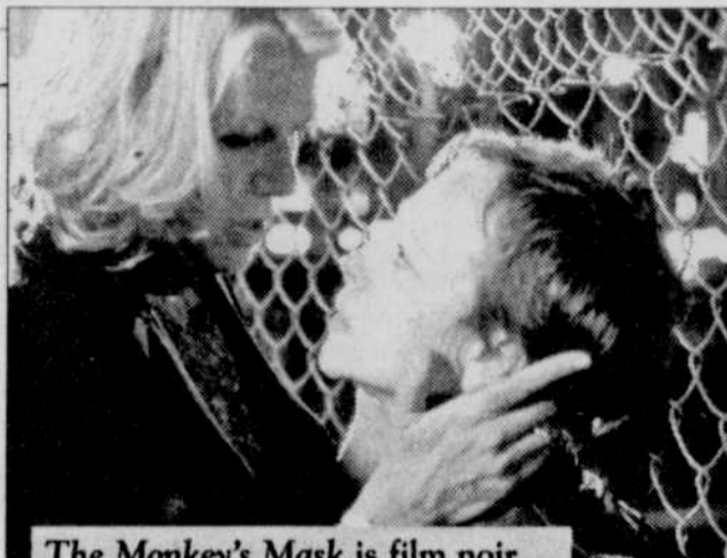
The Monkey's Mask is film noir about a sexually frustrated lesbian detective in search of her perp

* COME UNDONE: Teen-age French boys from different worlds—one a brooding, depressive young man with an ill mother, the other a life-loving, exuberantly sexual drifter—meet on