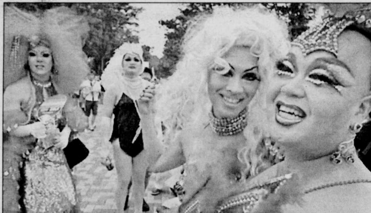
Drag queens celebrate Gay Pride on Aug. 26 in Tokyo's Toyogi Park