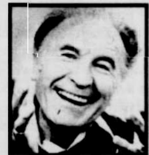
BARRY MORSE Lt. Gerard of TV's "The Fugitive"