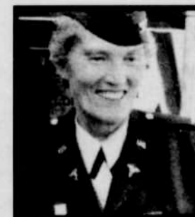
GRETHE GAMMERMEYER Author of "Serving in Silence"