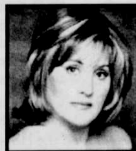
LORNA LUFT "Gyps & Dells" "Promises, Promises"

~ Benefiting Esther's Pantry & MCC-Portland ~