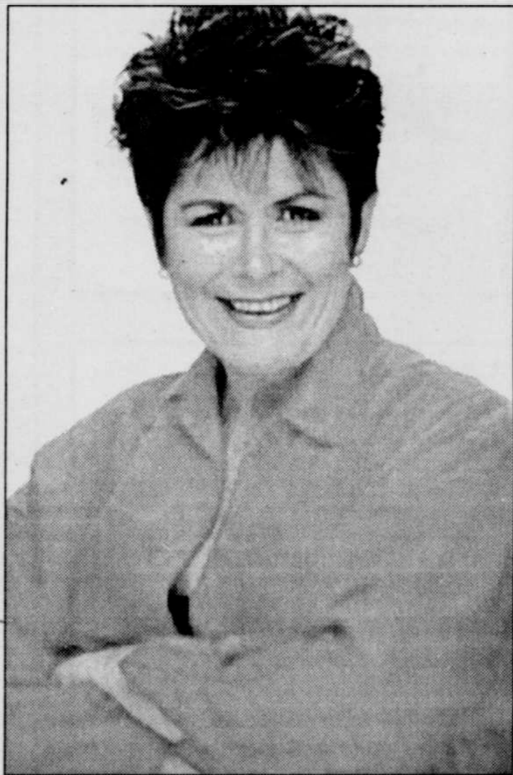
Mark your calendar: Comedian Kate Clinton will make an appearance at Basic Rights Oregon's as-yet-unnamed dinner Oct. 19