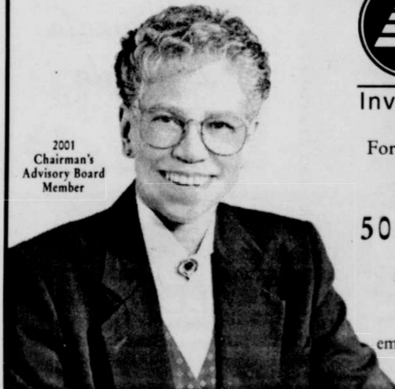
2001 Chairman's Advisory Board Member