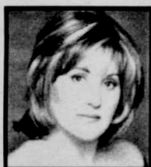
LORNA LUFT "Gypsy & Dolls" "Promises, Promises"

In Celebration of National Coming Out Day ~ Benefiting Esther's Pantry & MCC-Portland ~