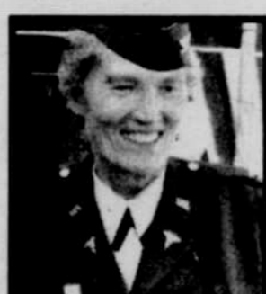
GRETHE CAMMERMEYER Author of "Serving in Silence"