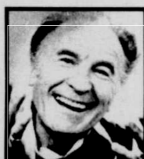
BARRY MORSE Lt. Gerard of TV's "The Fugitive"

With Presentation of the 2001 Shepherd's Award Thursday, October 11, 2001 World Trade Center Theater 121 SW Salmon, Portland