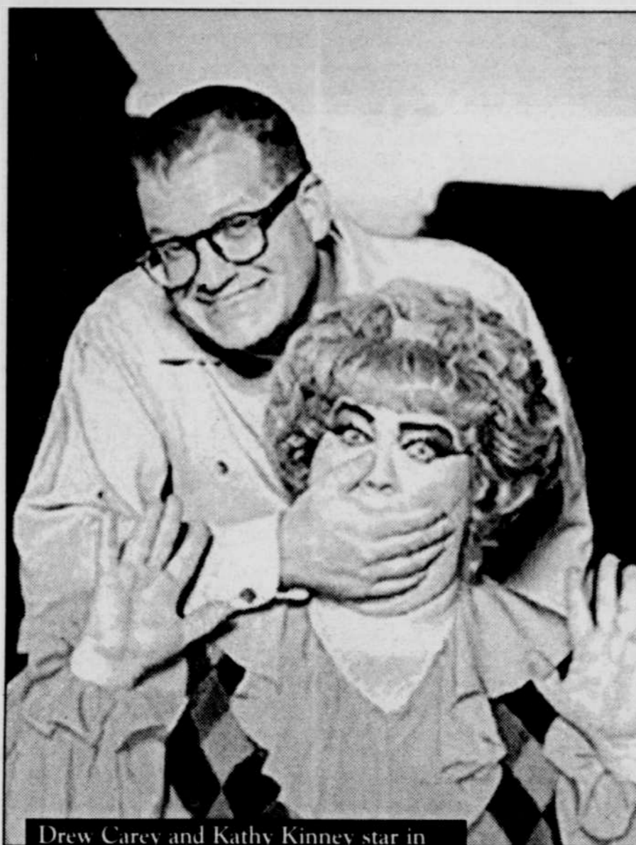
Drew Carey and Kathy Kinney star in The Drew Carey Show