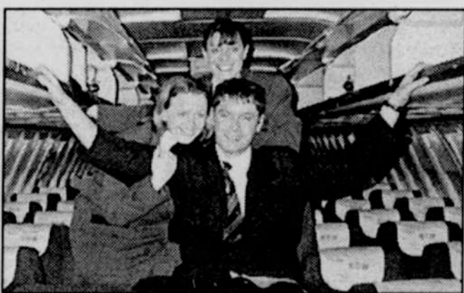
Co-workers congratulate Big Brother victor Brian Dowling

The government hopes to avert an embarrassing defeat before the European Court of Human Rights, where five of the men filed suit, the newspaper said. The men were prosecuted in 1998 under the 1967 Sexual Offenses Act after a private videotape of their escapades emerged.