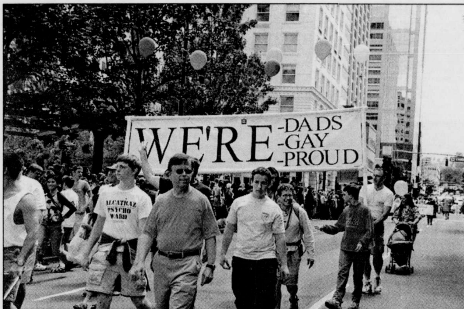
Just a little more than a month after Pride 2001, the planning already is under way for next year's celebration

For more information call 503-295-9788 or visit the Internet site www.pridenw.org .