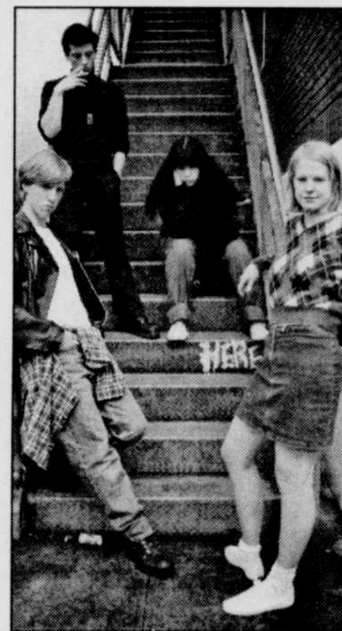
These kids just act Stupid

Then attend the triangle productions! presentation of Stupid Kids , which follows the lives of four almost normal teens overcoming the obstacles of stereotypes, hate and alienation. The play, part of the Sexual Minority Youth Internship Program, runs through Aug. 18 at Theater! Theatre!, 3430 S.E. Belmont St. Tickets are $5 to $12 from Fastixx or the box office, 503-239-5919.