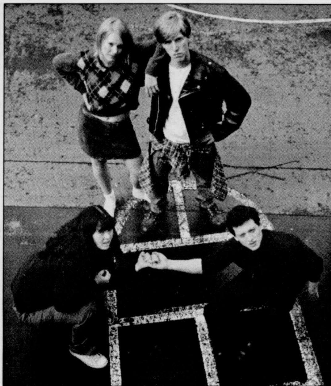
triangle productions! presents Stupid Kids through Aug. 18 at Theater! Theatre!

Human Rights Campaign , the largest national gay and lesbian political organization, lobbies Congress, provides campaign support and educates the public. Portland Steering Committee and Federal Club meet monthly to plan events. (503-244-6951.) (11/01)