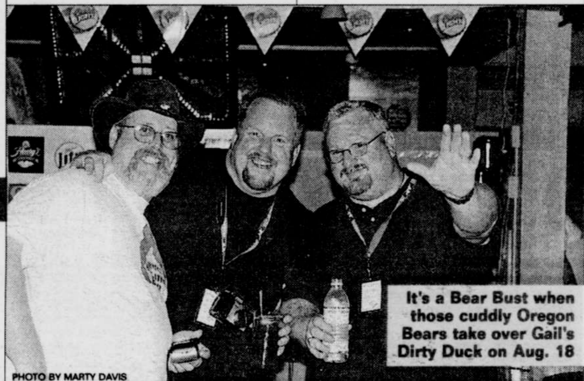
It's a Bear Bust when those cuddly Oregon Bears take over Gail's Dirty Duck 18

This much fun should be illegal! Those wacky gals of the Portland Lesbian Garden Club gather for their ninth annual Vita Sackville-West Croquet and Garden Party . This delightful event will be presented again this year by