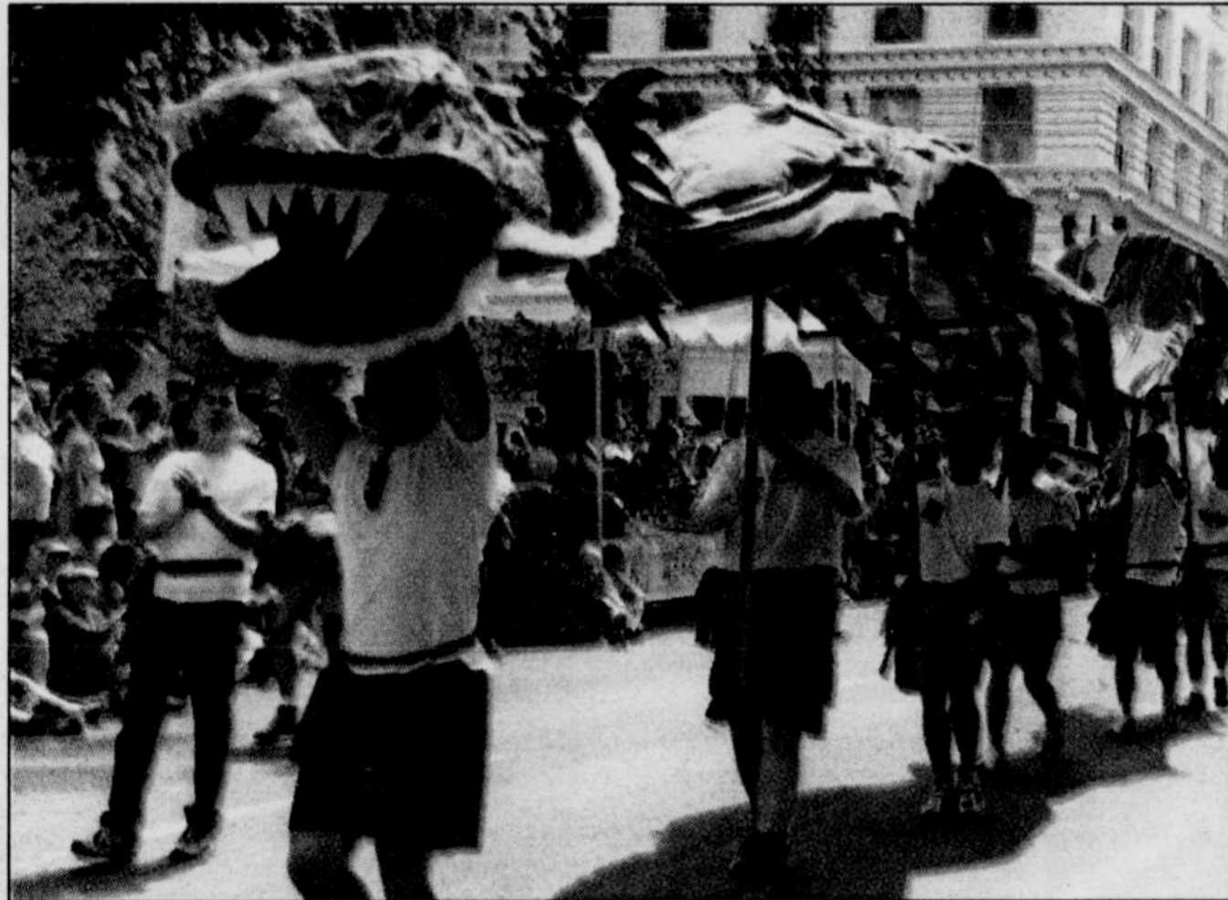
APLG roars along the Pride 2001 parade route

At one of their get-togethers, while gorging on home-cooked Asian barbecue or talking over dinner at a Vietnamese restaurant, you might encounter a whole salad of people: therapists, marketers, high-tech wizards, chefs, social workers, teen-agers and retired seniors. Their ethnicity ranges from Chinese to Viet-