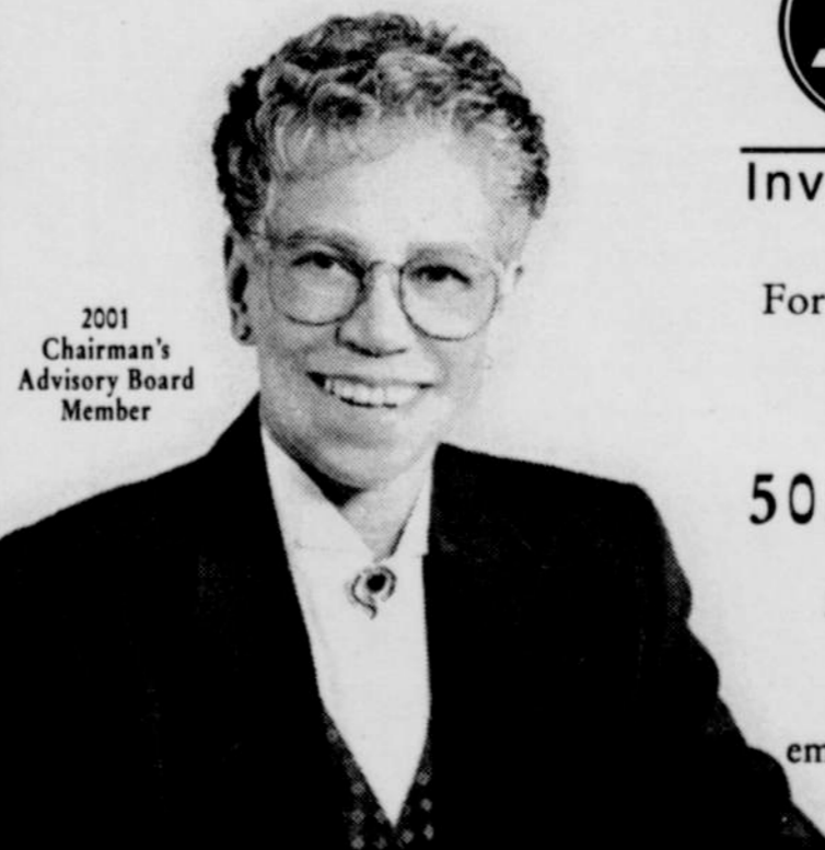
2001 Chairman's Advisory Board Member

500 N.E. Multnomah, Suite 278 Portland, OR 97232 www.waddell.com email: floreid32983@wradvisors.com Member SIPC