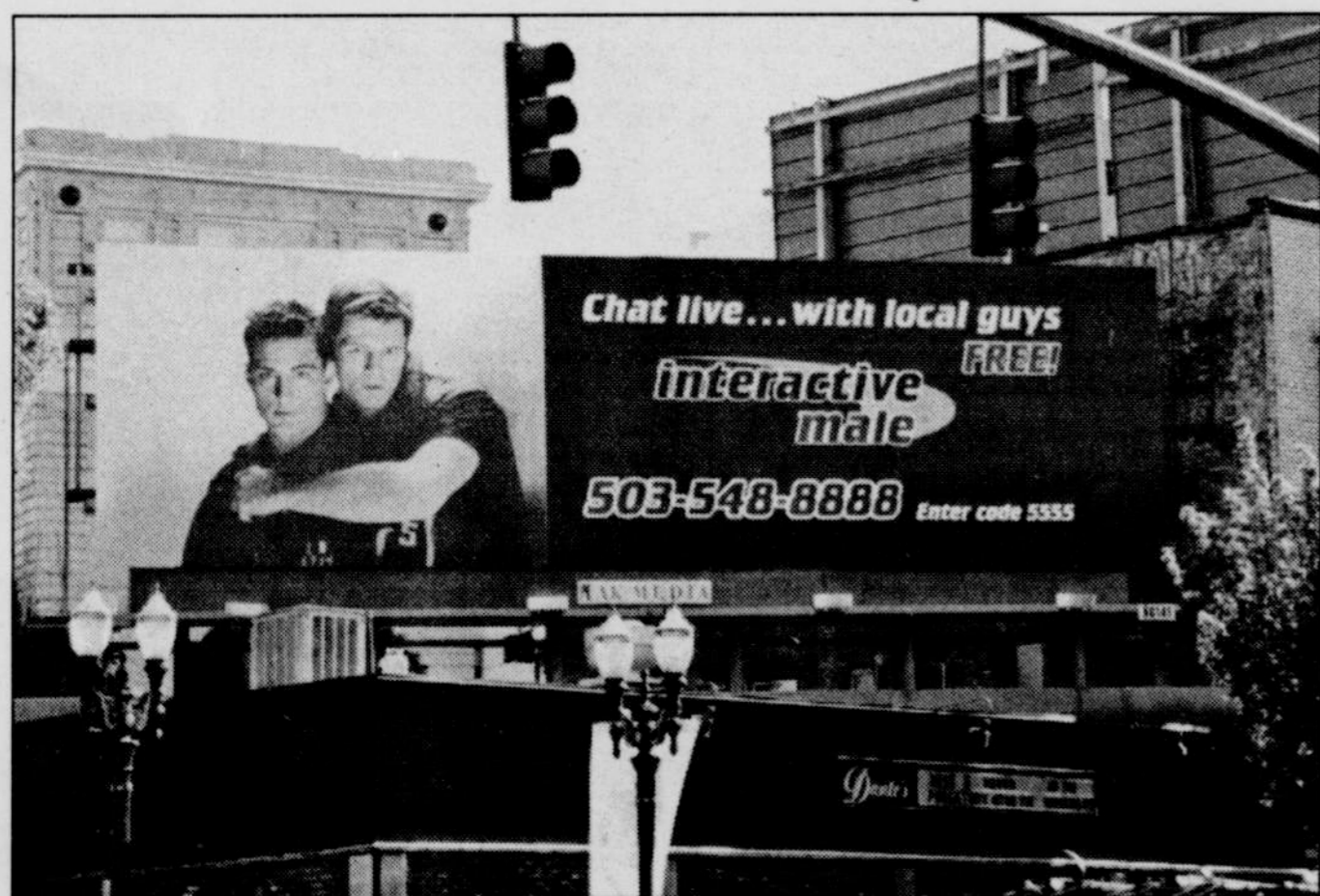
Outdoor advertising agency AK Media has received no complaints about this out and proud downtown billboard

Interactive Male, a gay dating service, has secured a prime location for its latest adver-