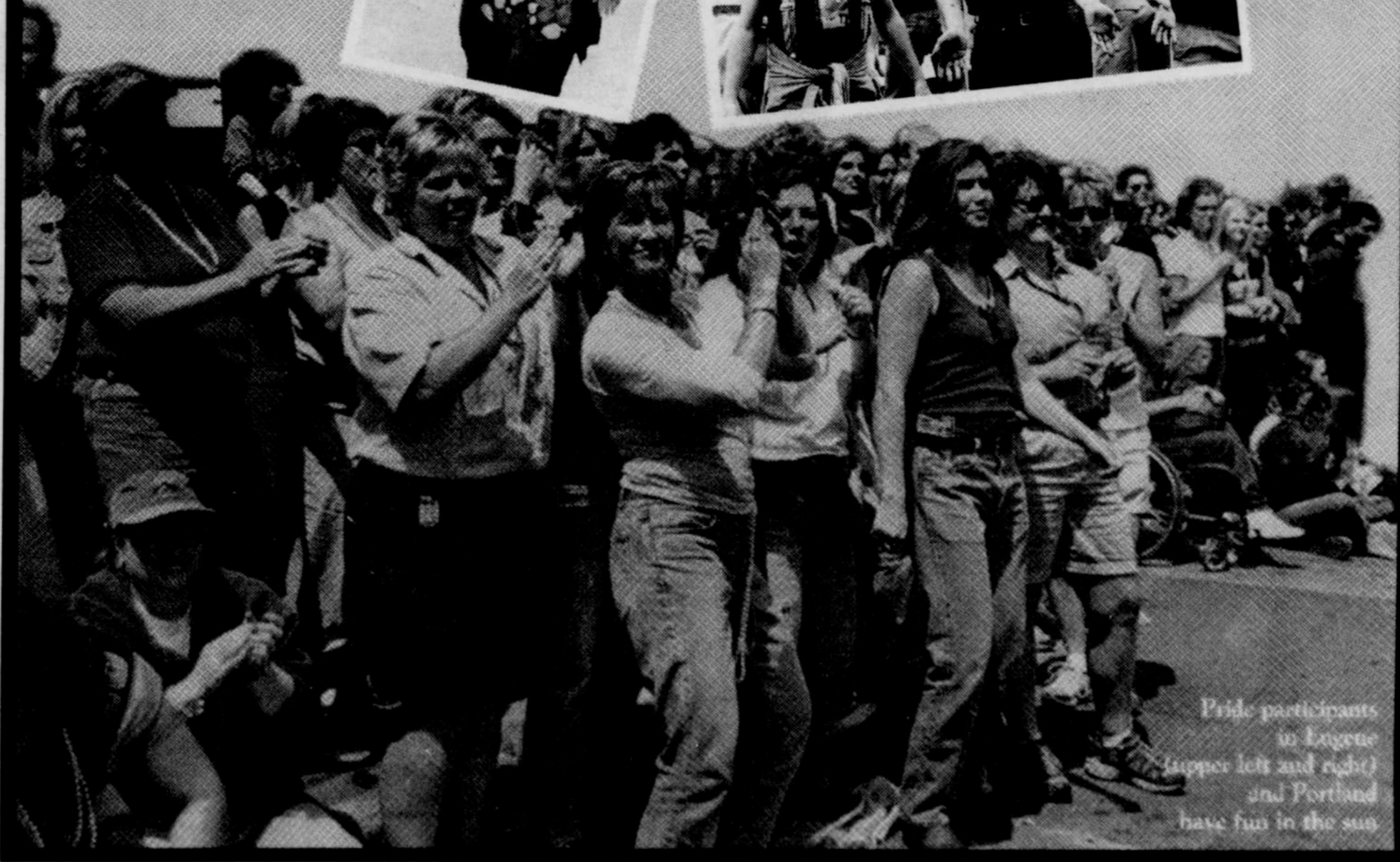
Pride participants in Eugene (upper left and right) and Portland have fun in the sun