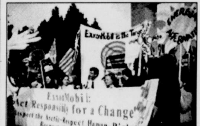
Protesters demand equality at ExxonMobil

The Human Rights Campaign called June 13 for a nationwide boycott of ExxonMobil because it has refused to reinstate a nondiscrimination policy covering sexual orientation and open its domestic partner benefits program to all gay and lesbian employees.