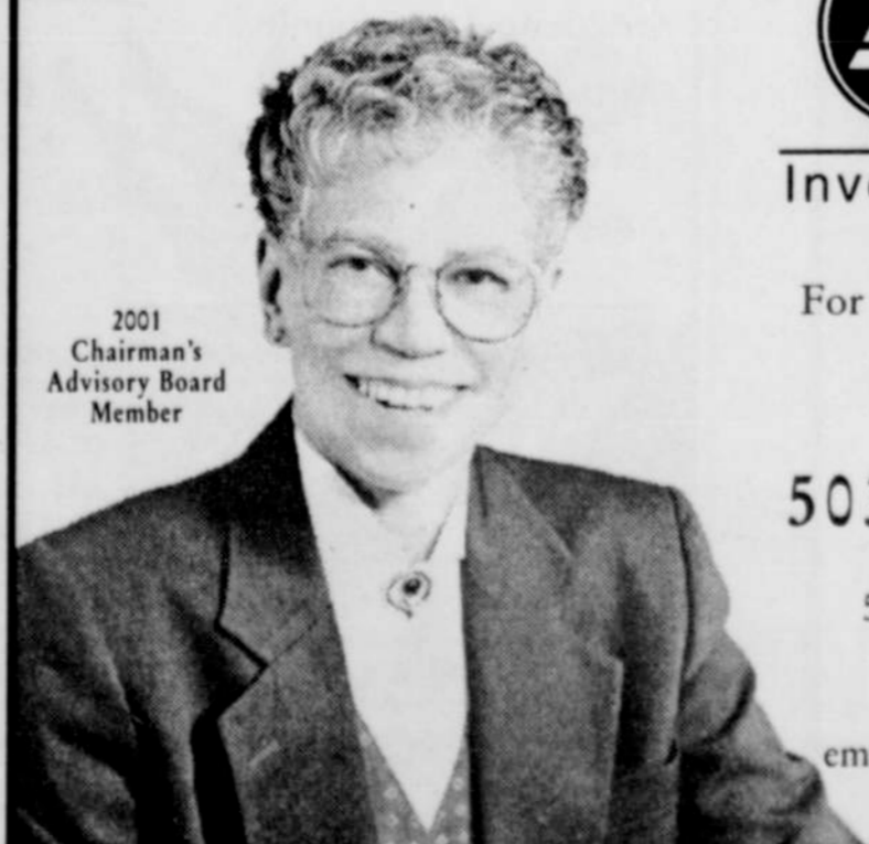
2001 Chairman's Advisory Board Member

Do you have a plan for your retirement? For your estate? How will your partner, family, children or yourself be cared for in the event of sudden illness or death? Do you have enough life insurance? I can help you understand the answers to these questions and so many more. All it takes to start is a phone call. Take control of your financial future before it's too late.