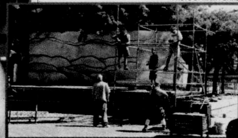
They will build it, but will you come?

"We have permission to be louder—a lot louder. This is a tremendous asset," Misha asserts. The Main and New Stages, both