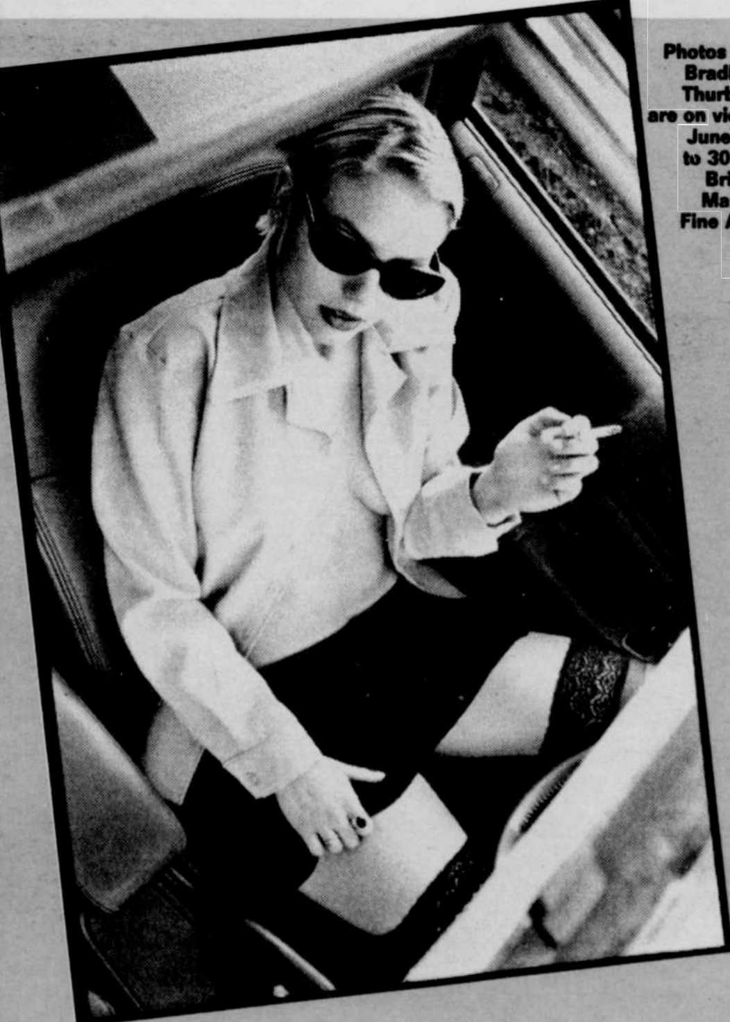
Photos by Bradley Thurber are on view June 8 to 30 at Brian Marki Fine Art

See On View and Onstage listings on Page 34.