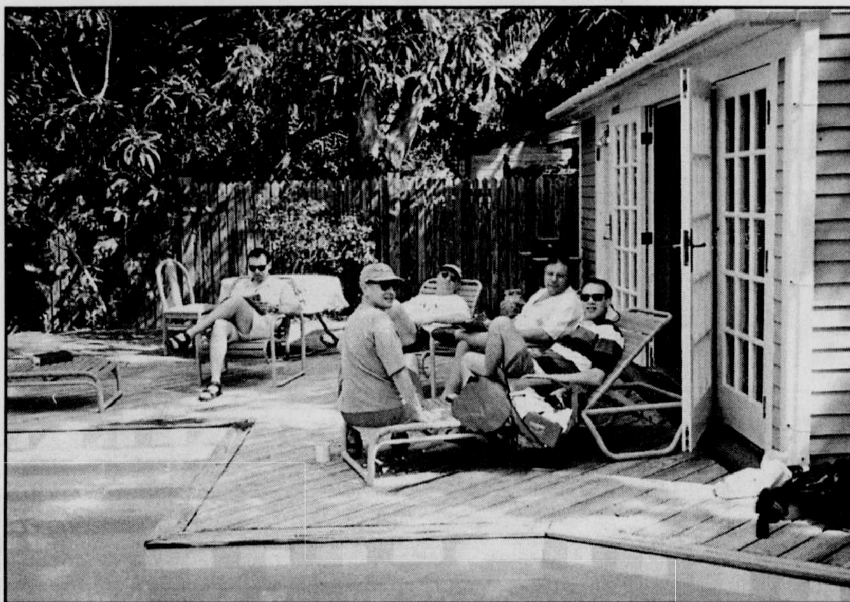
Living it up with a house—and pool—of their own

Our rental house was exactly what we had hoped for with a large, well-stocked kitchen, excellent sleeping arrangements and a perfect