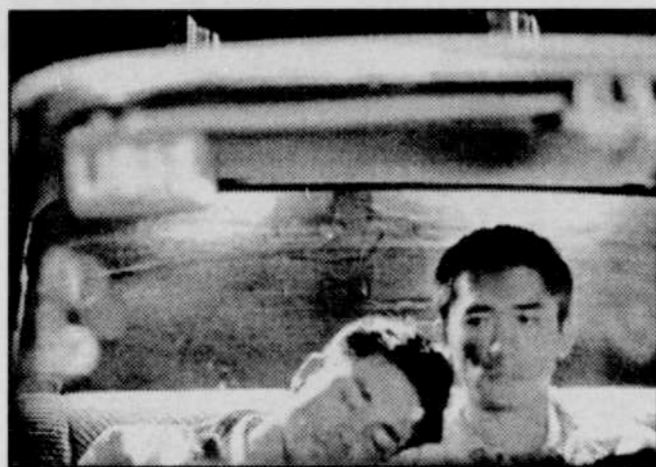
Leslie Cheung and Tony Leung in 1997's Happy Together