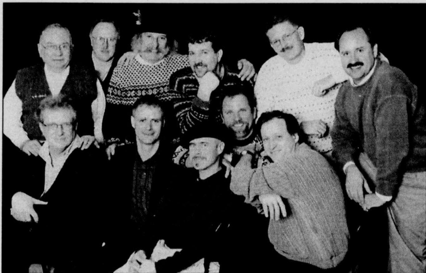
The Rogue Valley Gay Men's Chorus knows what to do with a drunken sailor

Imagine that you're a gay man living in one of the redneckier parts of Oregon, perhaps a few toes still safely in the closet, but you're hungry for camaraderie. Imagine that the Oregon Citizens Alliance has established strongholds throughout your area and that anti-gay ballot measures are an easy sell in your southern Oregon town. Now imagine that you summon your nerve and join a small group of gay men who are determined to sing in public—as the Rogue Valley Gay Men's Chorus. Gulp.