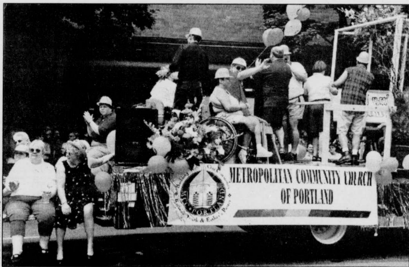
The 25-year-old Metropolitan Community Church of Portland reaches out to openly gay, lesbian, bisexual and transgendered Christians