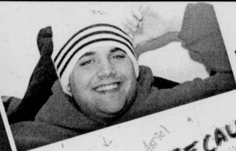
SMYRC settles into a larger facility in Southeast Portland

You laugh BECAUSE I'M DIFFERENT; I LAUGH BECAUSE YOU'RE ALL THE SAME!