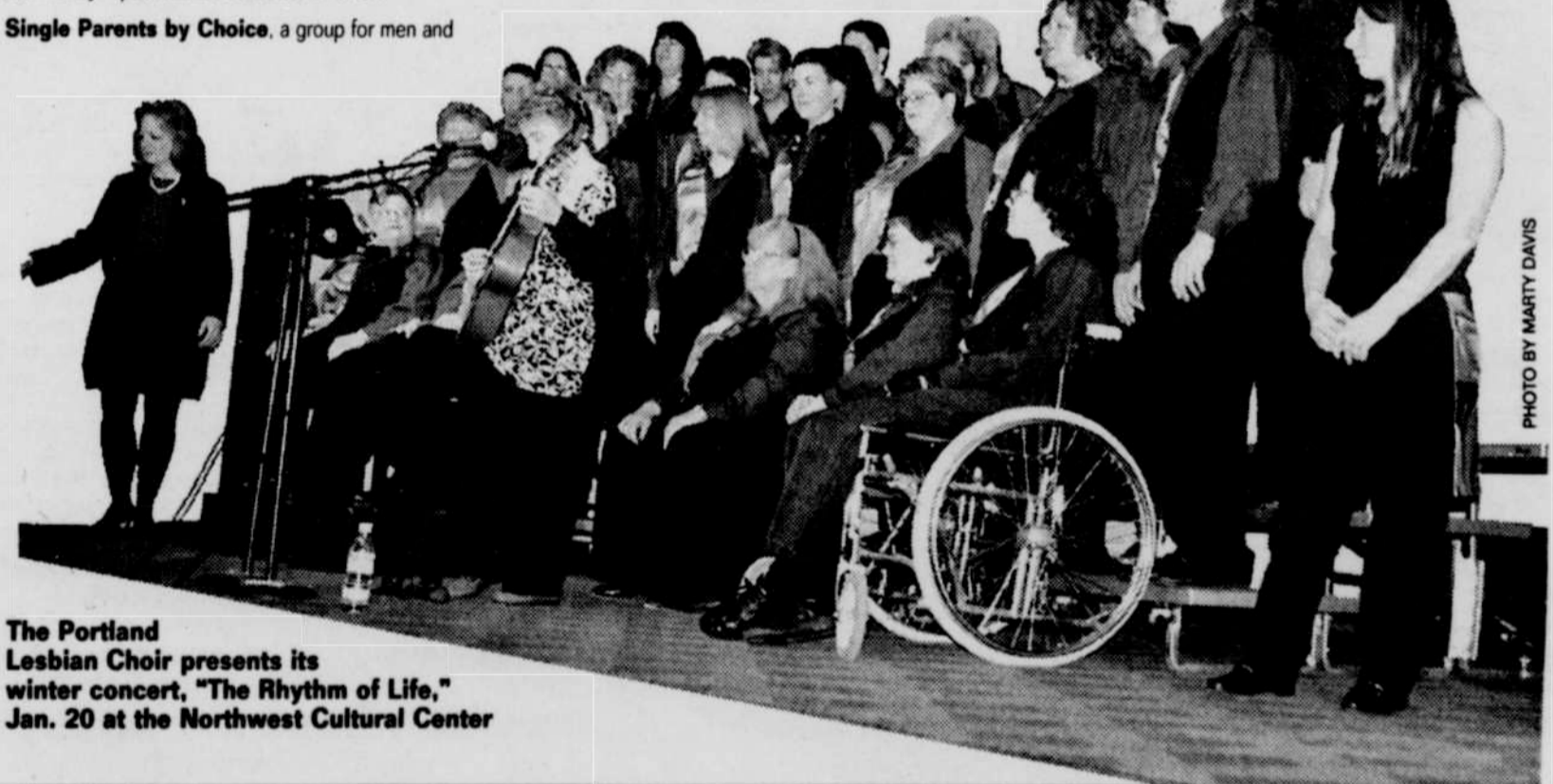
The Portland Lesbian Choir presents its winter concert, "The Rhythm of Life," Jan. 20 at the Northwest Cultural Center

Klamath Area Lambda Association (KALA) is dedicated to promoting awareness, health, understand-