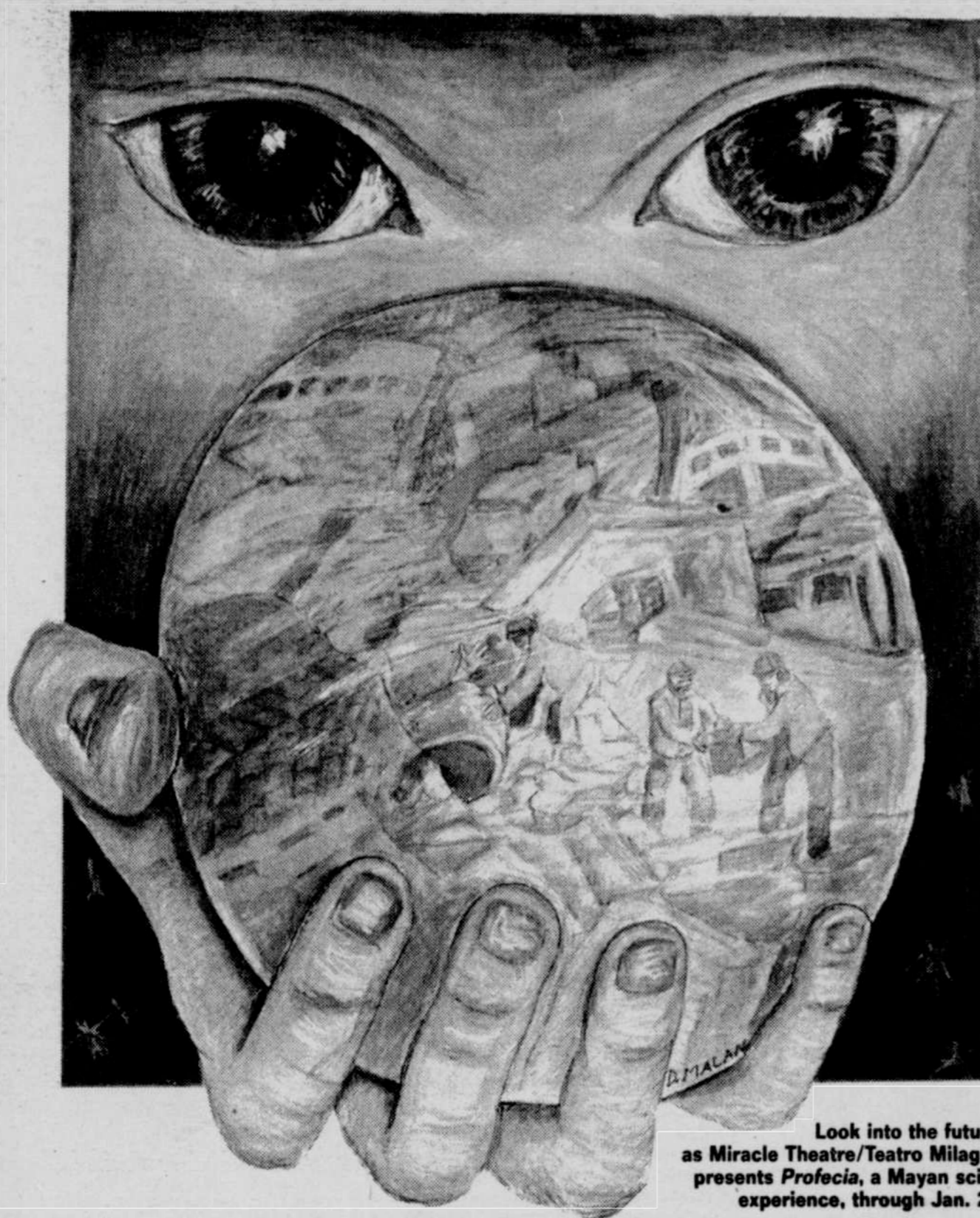
Look into the future as Miracle Theatre/Teatro Milagro presents Profecia , a Mayan sci-fi experience, through Jan. 27

Love Makes a Family holds a potluck and social for parents and kids at