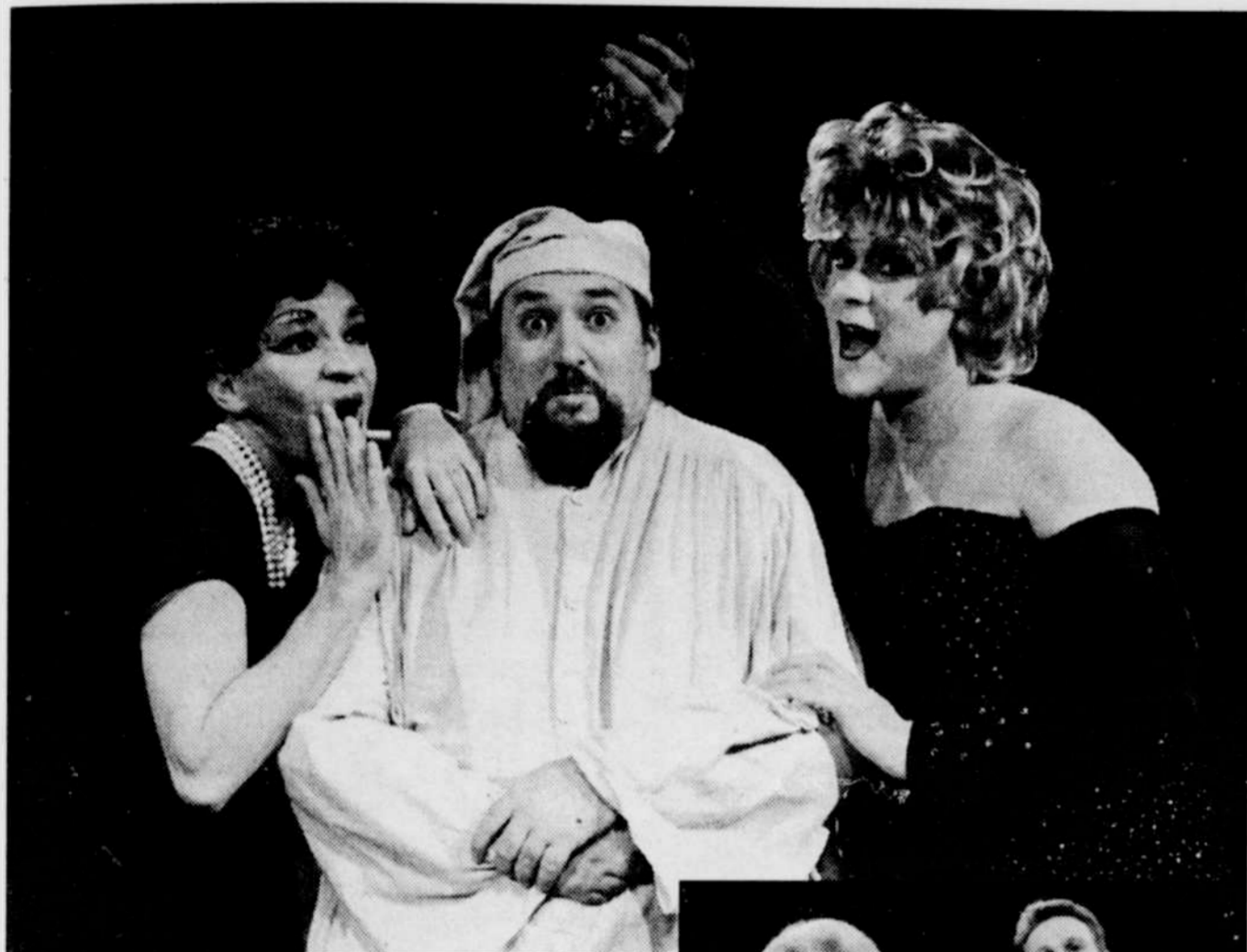
Scrooge gets dragged out of the closet

The holiday season is full of all sorts of fluffy things: fluffy snow, fluffy trees, fluffy presents, fluffy songs. And every year, like clockwork, two entertainment events happen to lend a little depression to our holiday cheer, although each has an uplifting message.