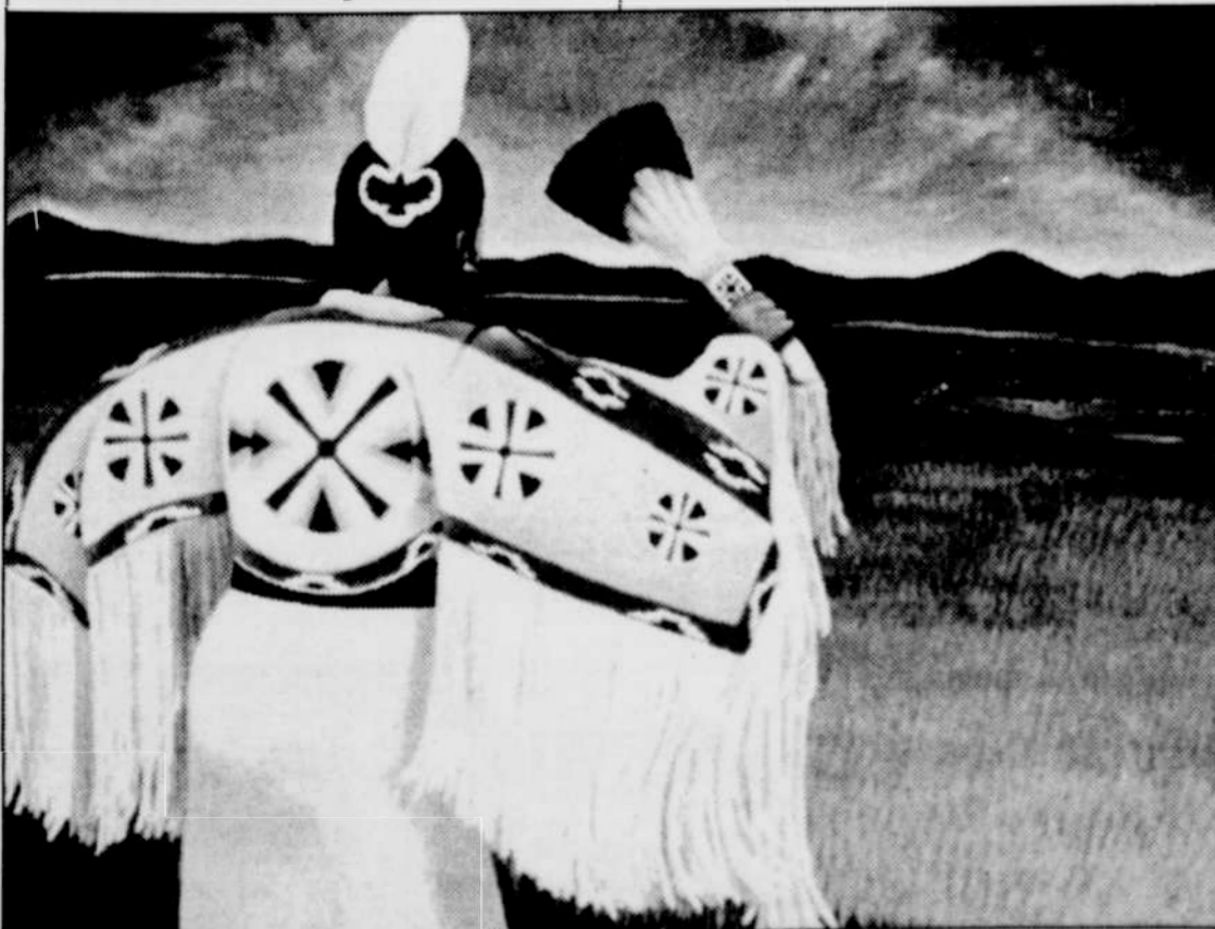
"Sacred Visitors" by Schar Cbear Friedman is one of the many artworks in We'Moon '01 ; join some of the creators at a reading Dec. 8