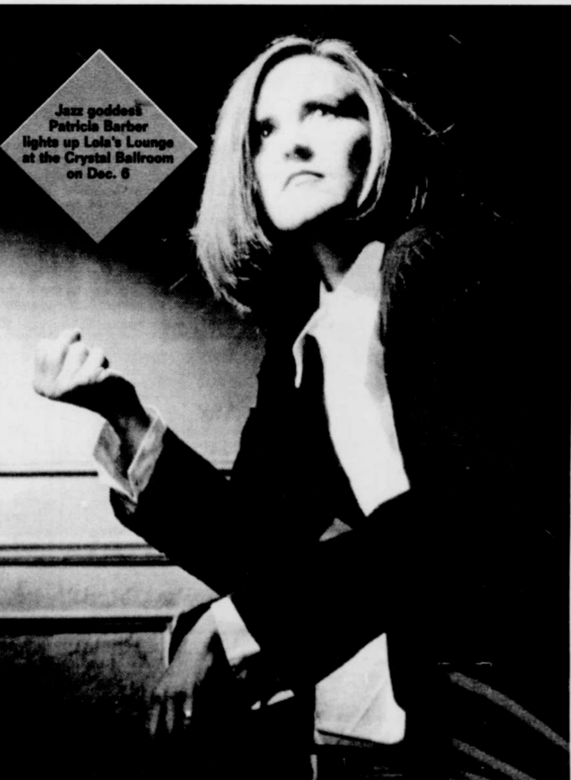
Jazz goddess Patricia Barber lights up Lola's Lounge at the Crystal Ballroom on Dec. 6