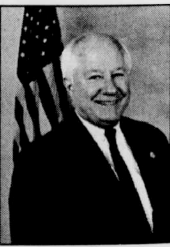
Rep. Jim Kolbe

A homeless shelter said "thanks, but no thanks" to a gay congressman who agreed to be a celebrity waiter during its annual Thanksgiving dinner, the Tucson Citizen reports Nov. 25. Then after receiving tons of bad press, the Gospel Rescue Mission suddenly got back into the holiday spirit and offered a "tearful apology" to U.S. Rep. Jim Kolbe, R-Ariz.