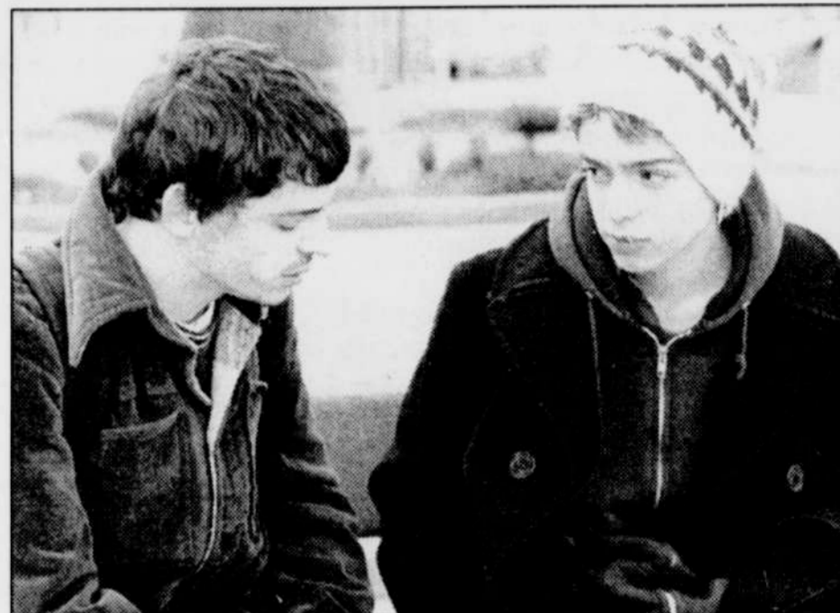
Produced and shot in Oregon, Eban and Charley was among the festival favorites

Festival organizers realize you can't please