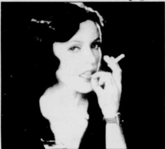
aimee and jaguar

FRIDAY, OCTOBER 20 aimee and jaguar @ 7pm gypsy boys @ 9:30pm