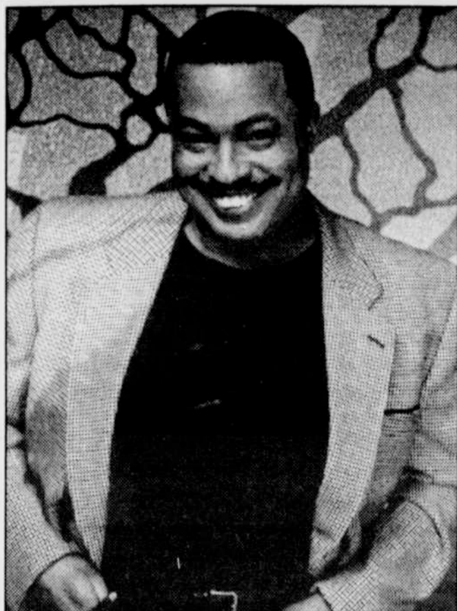
E. Lynn Harris