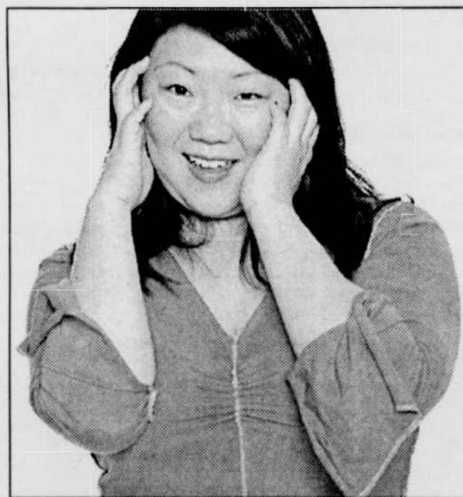
She'll give you a Cho-rtling good time

And on Oct. 29, Jog's gets a head start on Halloween with a fire show and costume strippers. The fun begins at 8 p.m., and there is no cover charge.