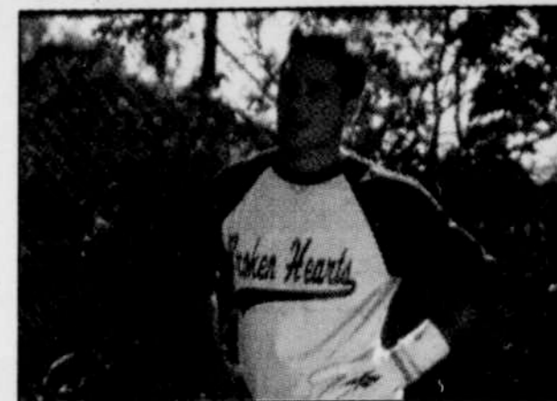
the broken hearts club