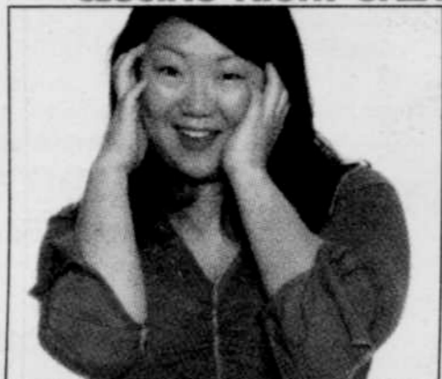
i'm the one that i want