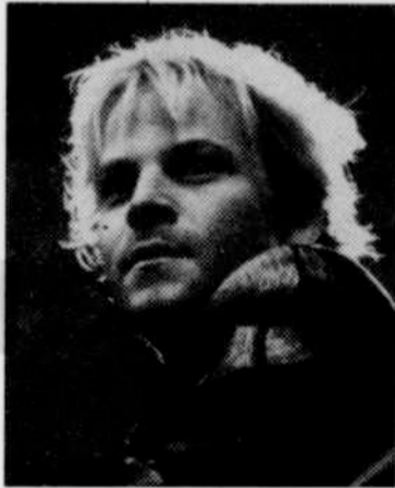
Stephen Dorff is Cecil B. Demented

FilmTalk , a discussion group for gay, bisexual and transsexual men, discusses the new movies But I'm a Cheerleader and Cecil B. Demented at Old Wives' Tales Restaurant. (7-9 pm. 1300 E Burnside St. 503-220-0618.)