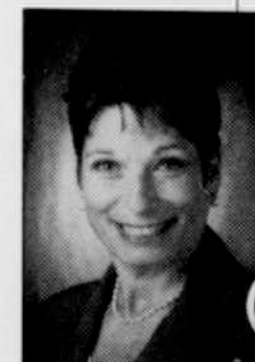
Mayor Vera Katz