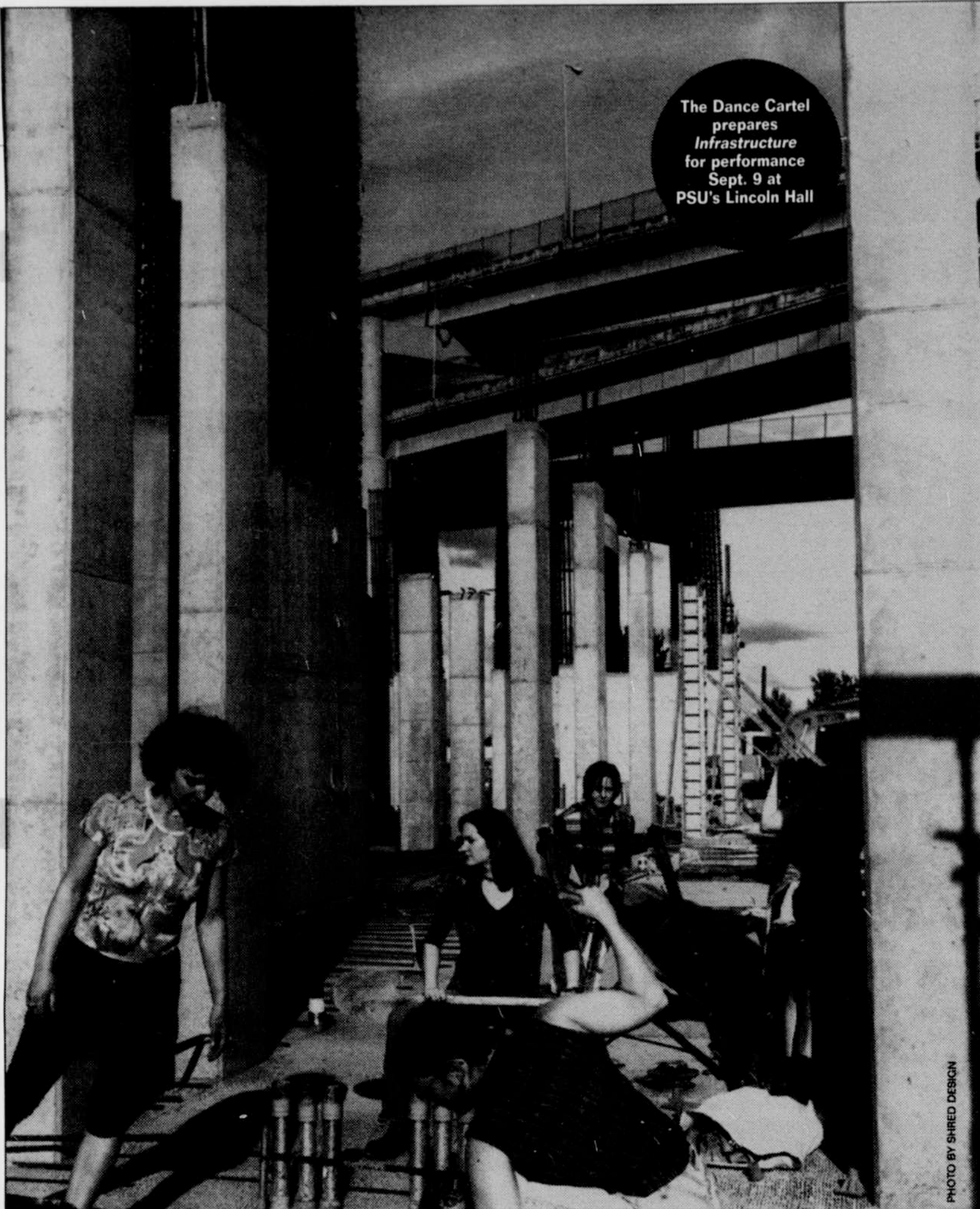
The Dance Cartel prepares Infrastructure for performance Sept. 9 at PSU's Lincoln Hall

Stark Raving Theatre offers Suburban Motel Part 1 through Sept. 30