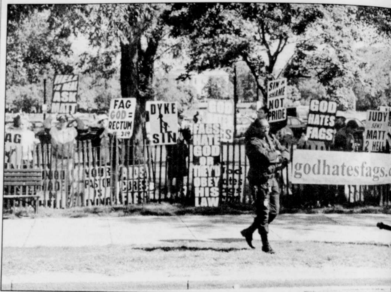
Fred Phelps and his crew were out in full force during the Millennium March on April 30 in Washington, D.C.