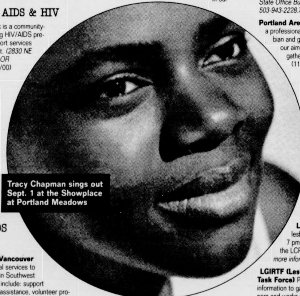
Tracy Chapman sings out Sept. 1 at the Showplace at Portland Meadows

The Portland Lesbian Choir welcomes supportive members and volunteers. (503-241-8994.) (11/00)