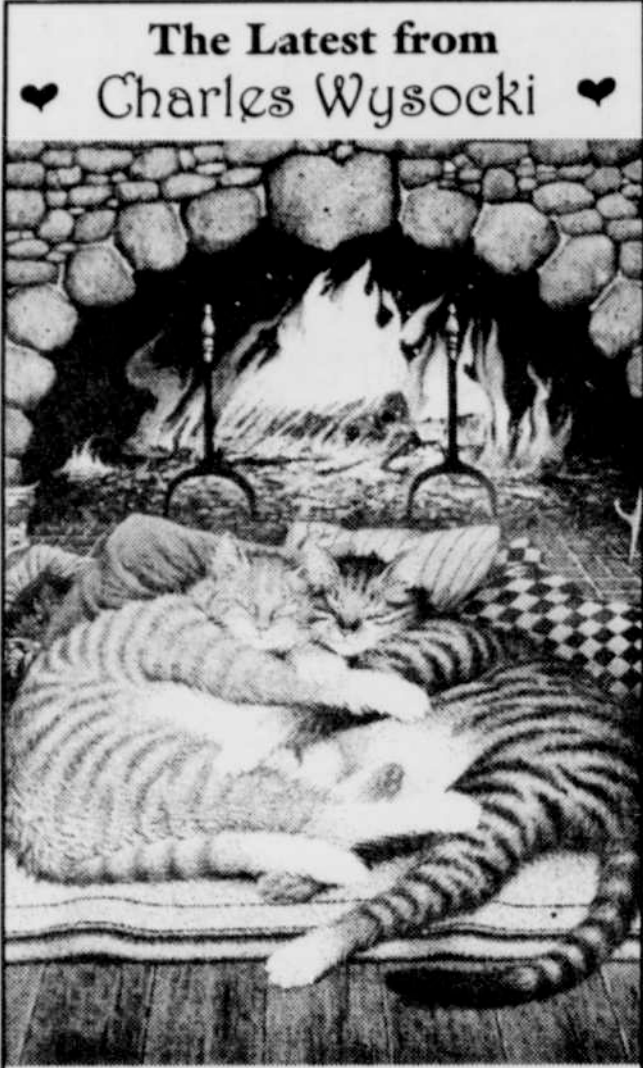
Edition of 6,500 s/n • 20 x 24" US: $200 CDN: $300

detail from "All Burned Out" As Max and Remington embrace and bask in the fire's warmth, three mice tentatively peer out from the wood pile and from behind the fireplace shovel. These intruders are in no hurry, understanding from experience that there will be plenty of time to play.