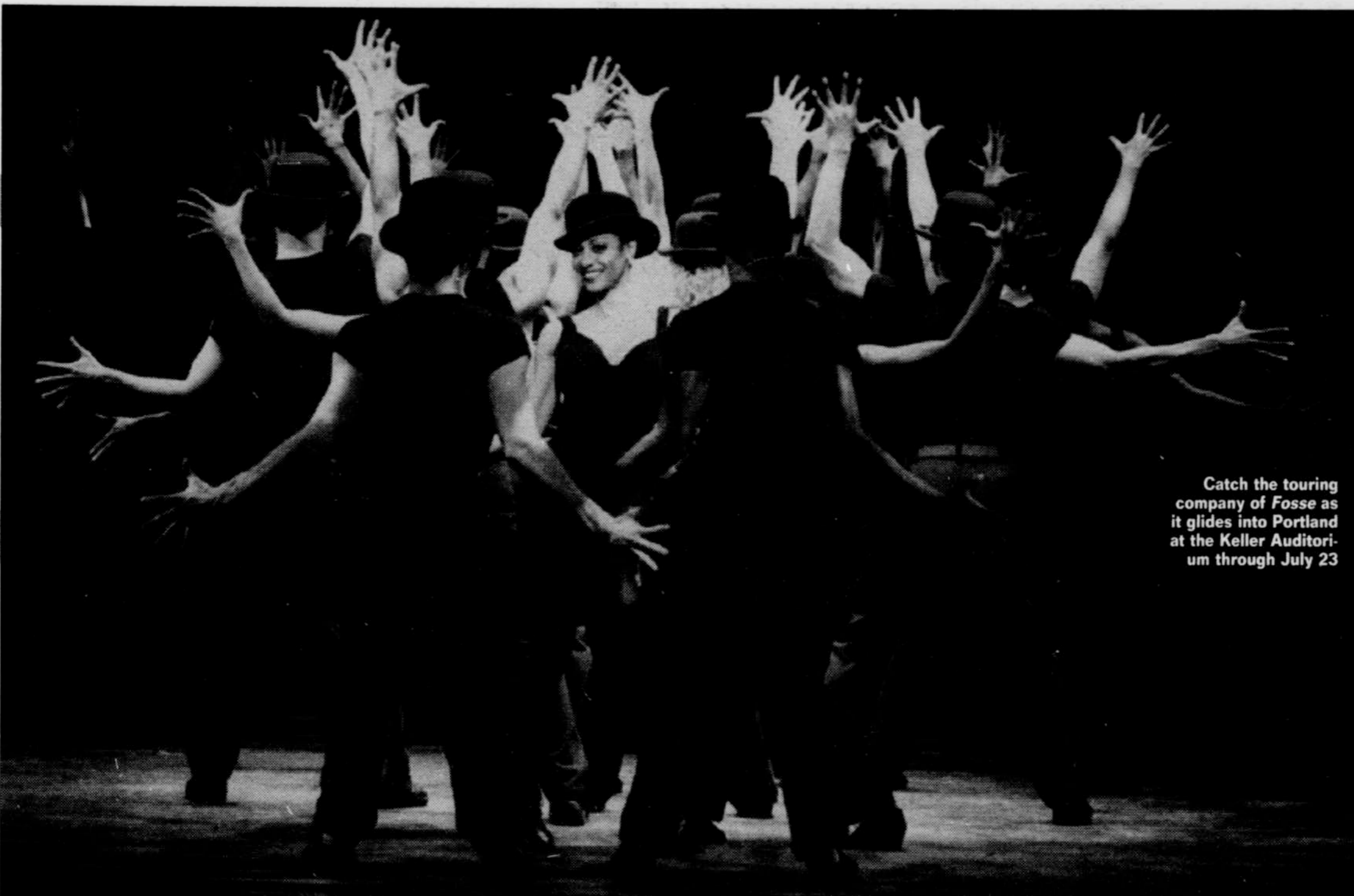
Catch the touring company of Fosse as it glides into Portland at the Keller Auditorium through July 23