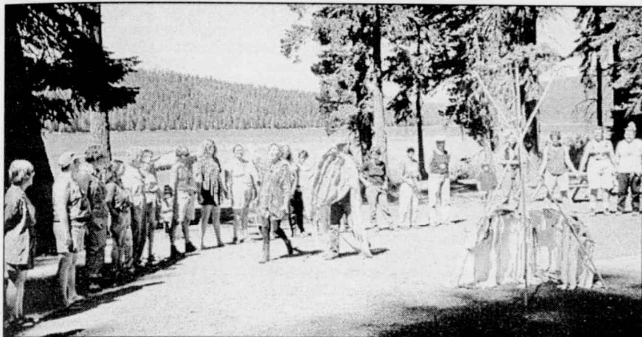
Women head for the hills every September at Womansource

I am proud of our community, even though it isn't perfect. There are problems and struggles and divisions, but for the most part, women in southern Oregon have learned to work together to honor both our commonalities and our differences.