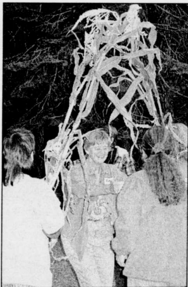
Making magic in the woods

The tradition is that, once a year, for three days and nights in September, we gather together at a camp in the mountains. We don't bring in big-name performers or national acts. It's a calling of ourselves—rural lesbians, allies and friends. And as we come together, we look