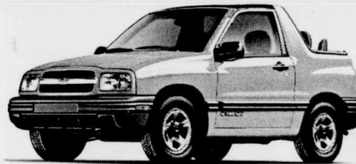
Convertible, 5 Speed, Stock # 91064