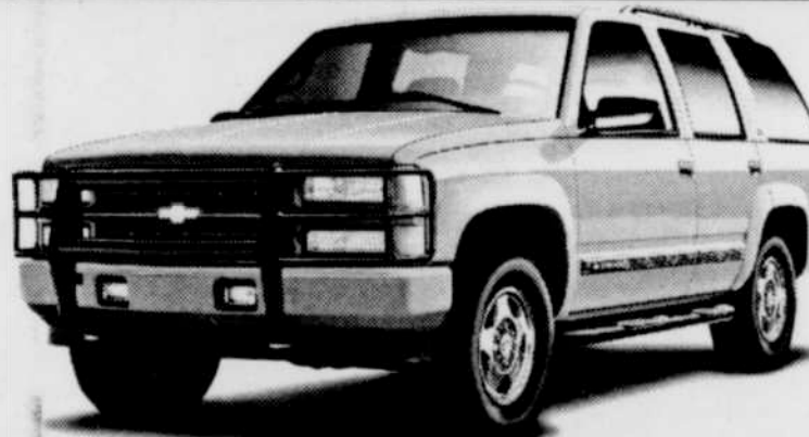
Z71 Off Road Pkg., Air, CD Player, Remote Keyless Entry, Leather. Stock #01348. MSRP $37,641