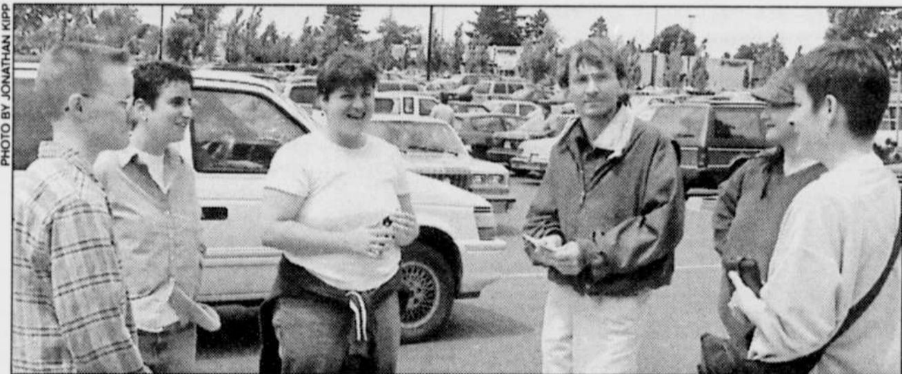
Bigot Busters taking a break to confer with one another at Eastport Plaza

Bigot Busters is not so much an organization