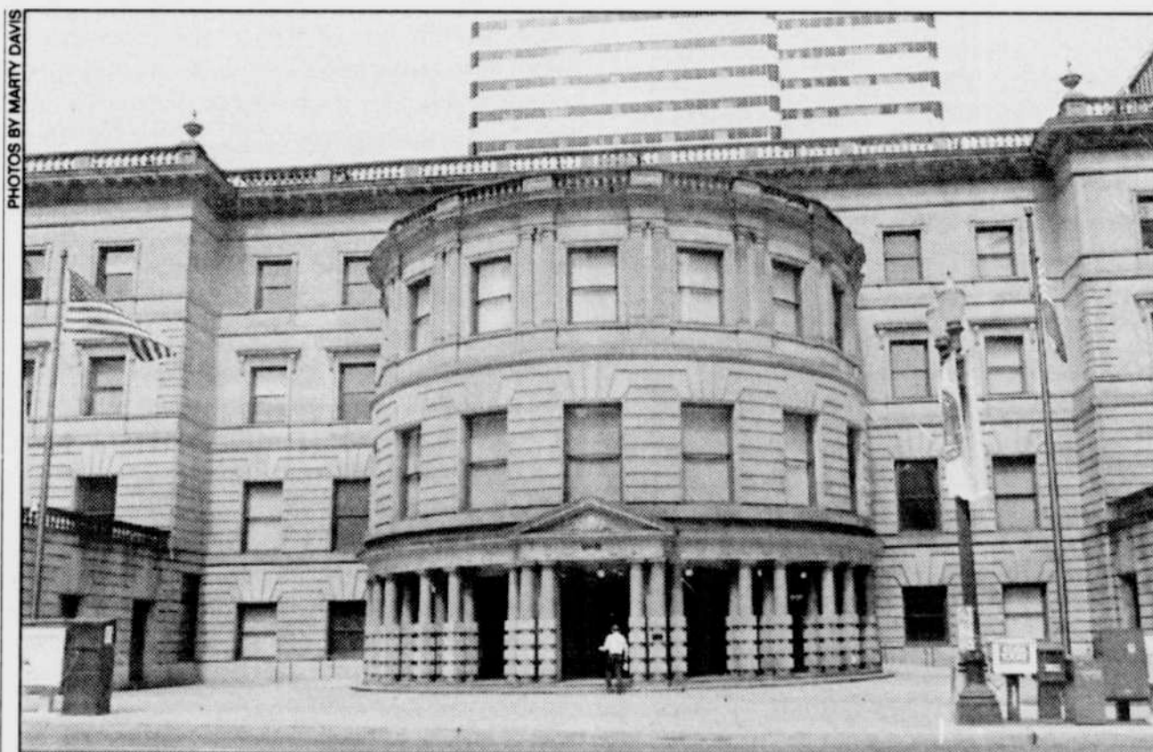
City Hall, in downtown Portland, might host some same-sex unions in the near future

A domestic partnership registry law, with similar wording, is on the books in Ashland,