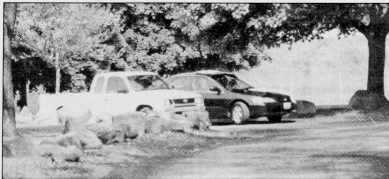
Drive-up service at East Delta Park on a recent weekday afternoon